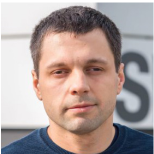
Vice President for Artificial Intelligence Development