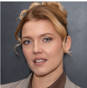
Vice President for Communications