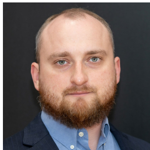
Dean of Students