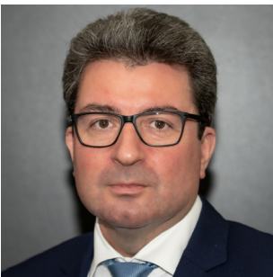
Vice President for Strategic Partnerships