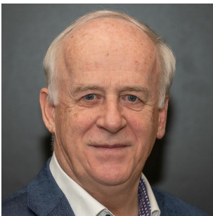
Dean of Education