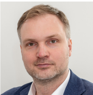
Vice President for Research Infrastructure