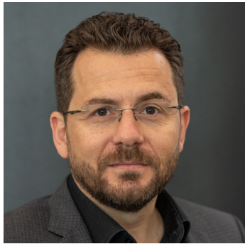
Provost Pavlos Lagoudakis