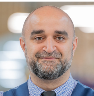
Vice President for Technology Partnerships