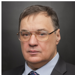
Vice President for Security