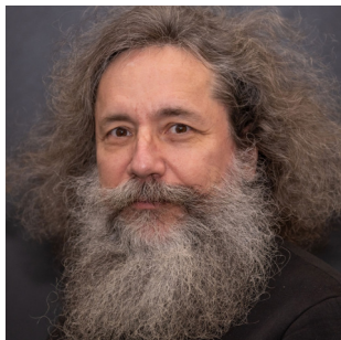
Vice President for Biomedical Research