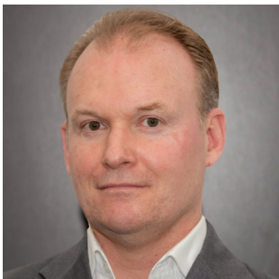
Vice President for Entrepreneurship and Innovation