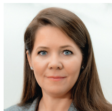
Anastasia Rakova Deputy Mayor of Moscow in the Moscow Government for Social Development