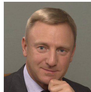
Dmitry Livanov Rector, Moscow Institute of Physics and Technology