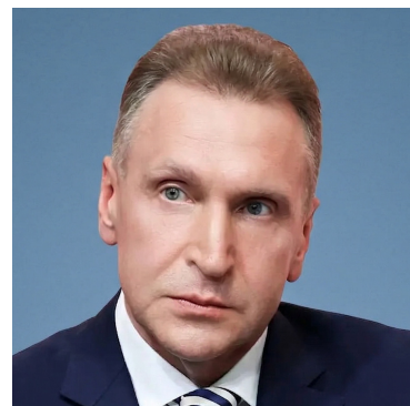
Igor Shuvalov Chairman of the Board of Trustees Chairman, VEB.RF