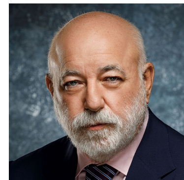
Viktor Vekselberg Deputy Chairman of the Board of Trustees Chairman of the Board of Directors, Renova Group